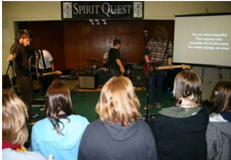
Santa Monica and Downey youth look on as the band prepares the next song